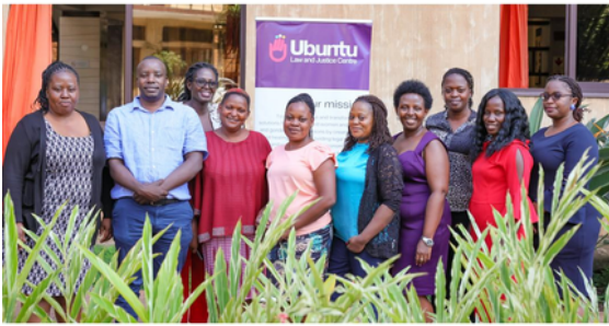
The UBUNTU Squad